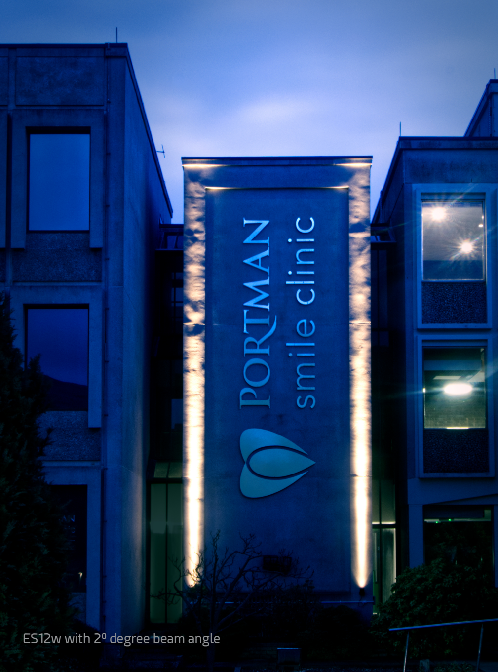
ES12w with 2° degree beam angle